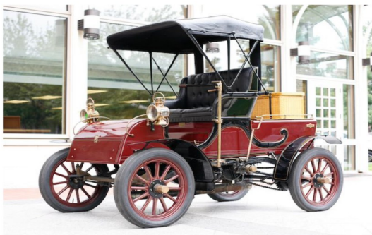
1904 Knox Stanhope Car

If you have ever seen an engine from a Knox Car you will not soon forget it. The cylinder head gets it cooling not from cooling fins but from a great number of large spike like nails joined around the circumference of the cylinder head! JB