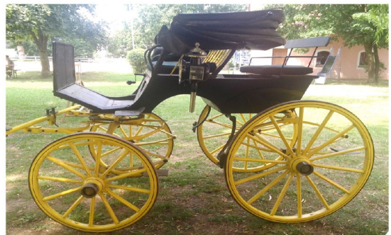
An early Stanhope Carriage